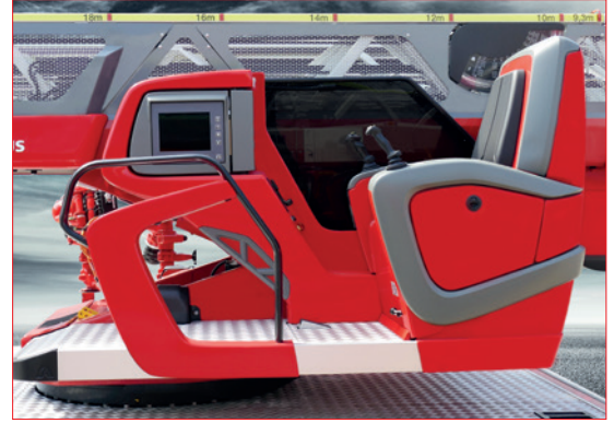
Ergonomic main control stand