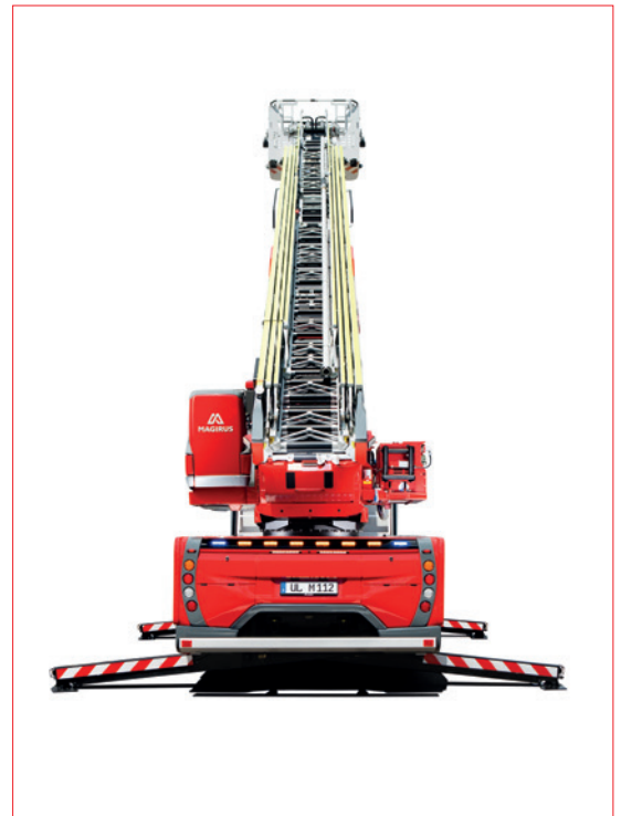
VARIO jacking system

Illustrations may include additional options. We reserve the right to make technical changes or improvements at any time without prior notice. Errors and omissions excepted.